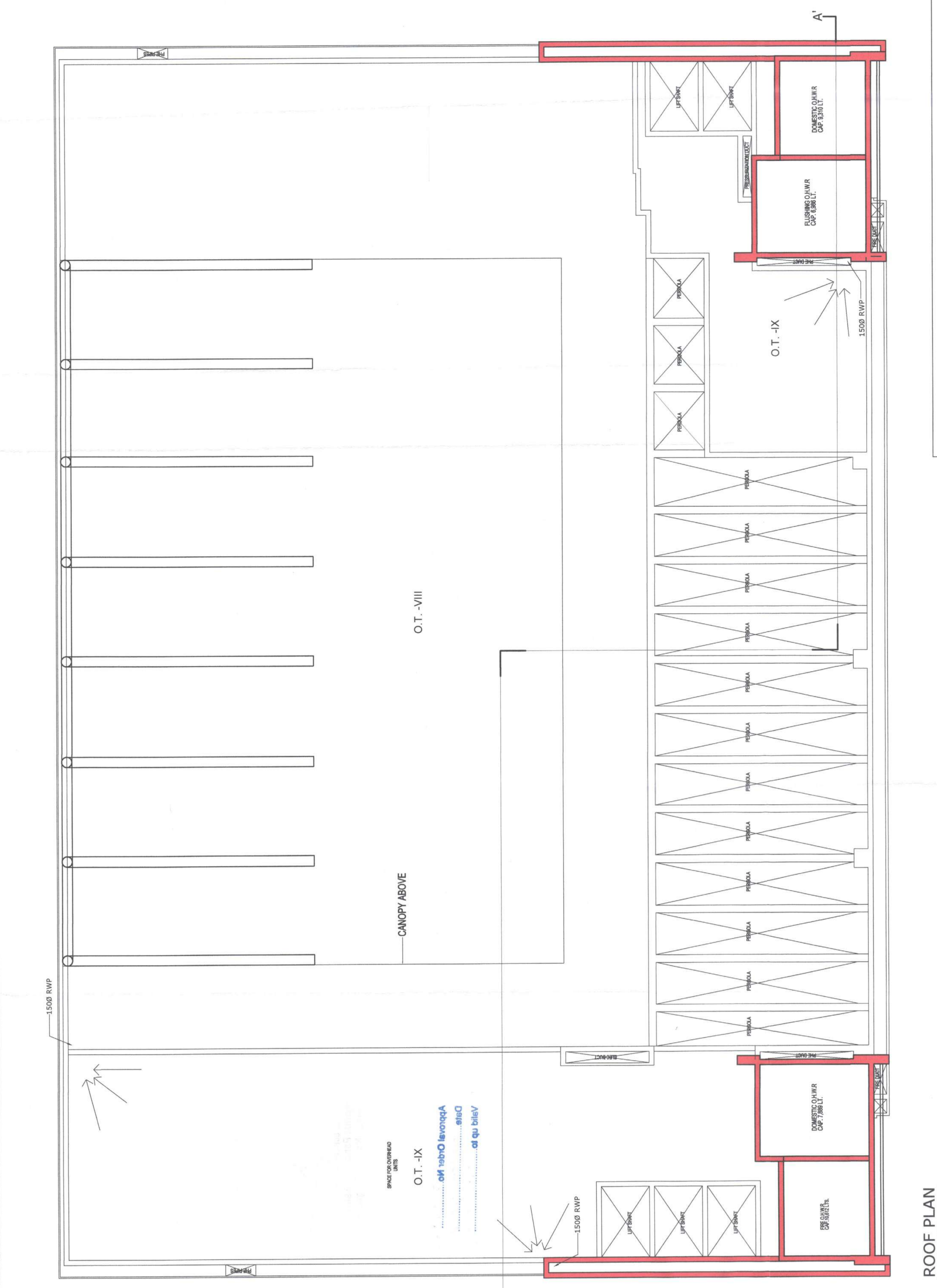
ROOF PLAN Scale - 1:100